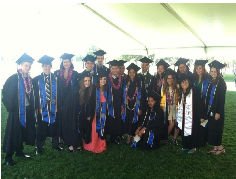
ETX Graduates, 2013

Further practical experience can be gained by participating either in research projects or in internships with government agencies and private laboratories (for which University credit is available). Courses in written and oral expression, social sciences, humanities, and unrestricted electives round out the program.